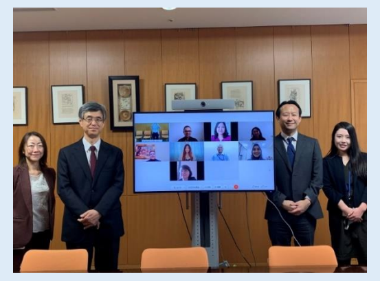
Photo: FSA Commissioner HIMINO and GLOPAC Visiting Fellows of the 17th group

Under the current circumstances where it is difficult to invite the Visiting Fellows to Japan due to the spread of COVID-19, we operate virtual trainings by using a Webinar tool. As they participate in lectures from their home countries, there are a kind of challenges such as differences in time and Wi-Fi condition. Even so, they proactively attend and have interactive discussion session in the course of Program.