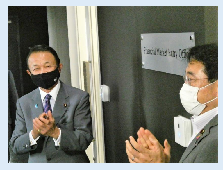
Photo: Finance Minister ASO (left) and State Minister AKAZAWA (right) unveiling the sign for the office at the opening ceremony

For further accelerating this activity, it is important to develop an environment to enable financial businesses to make consultations easily. Instead of assuming a wait-and-see attitude, the FSA has opened the office at a location more convenient for businesses, thereby lowering physical and psychological hurdles with the expectation of achieving smoother entry procedures.